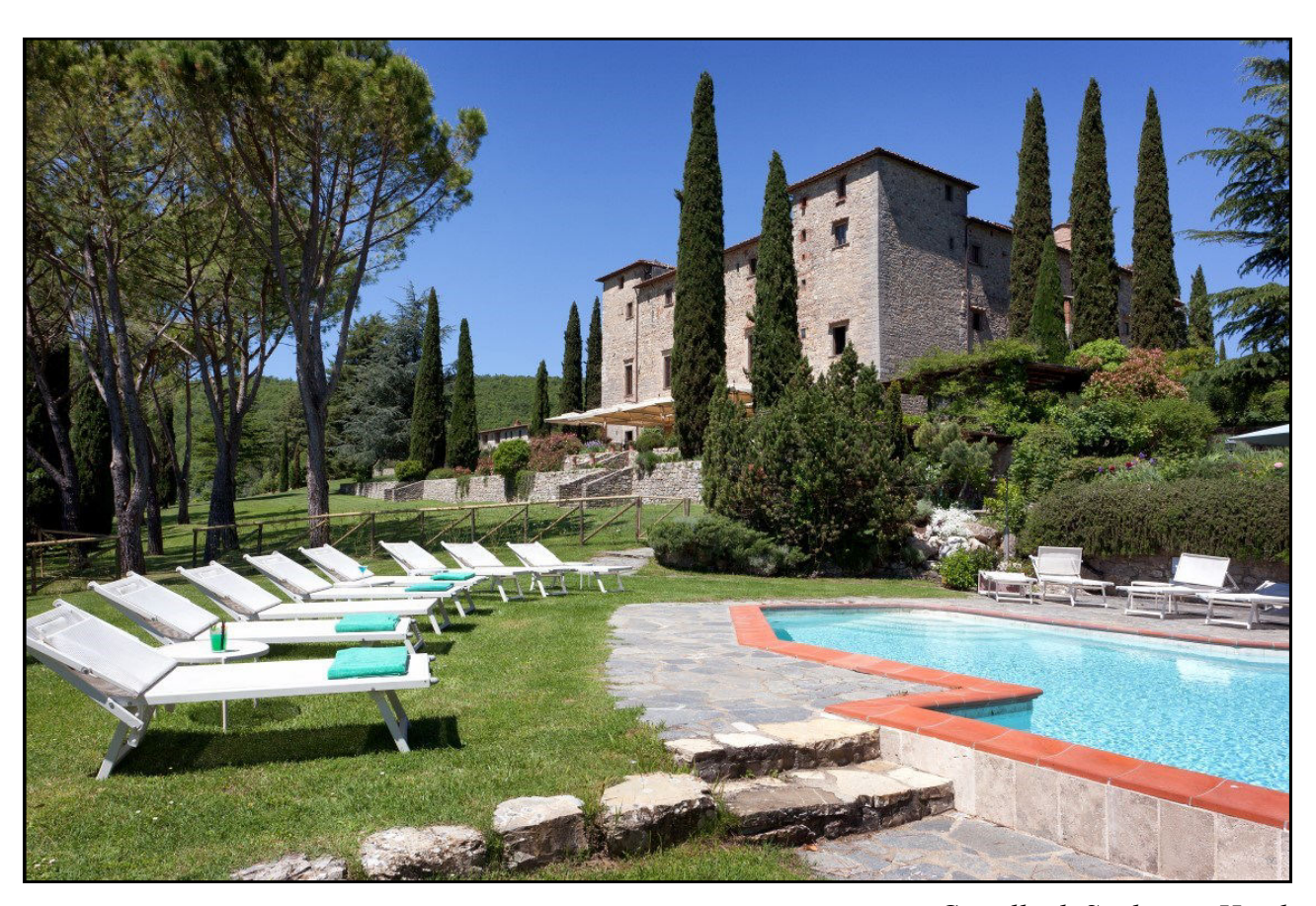
Castello di Spaltenna Hotel